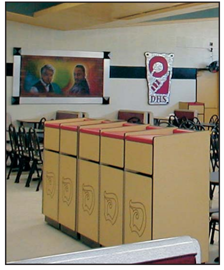
▲Dominguez High School in Compton, CA with optional school logo on the front.