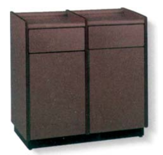
▲ Model U-4 Double Trash/Recycling unit. Supplied with two removable 25 gallon rigid waste container