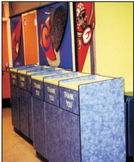
▲ Miami Edison H.S. in Miami, FL, with a contrasting color on the tray return area and optional message on the flipper doors.