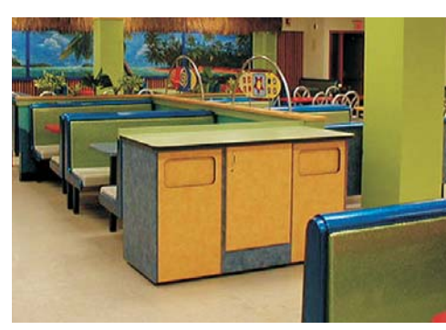
▲ Condiment display center with locking storage door — 5' 3" wide top surface for all your condiment needs.