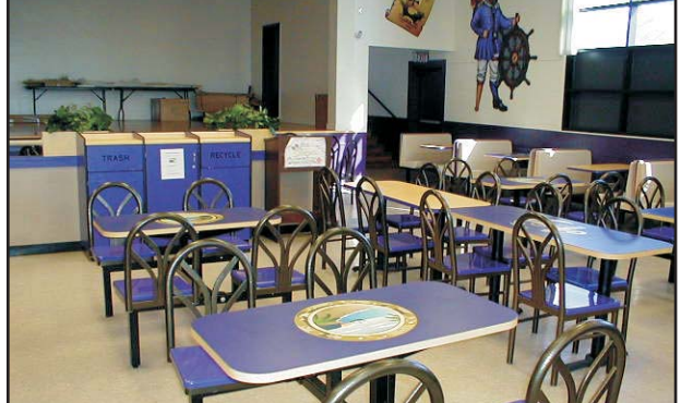
▲ Pacific High School in San Bernardino, California with pirate purple finish.