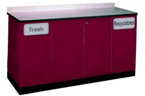
▲ CC-53 Condiment center with recycling/trash module and locking storage unit. Also available with optional genuine Corian<sup>TM</sup> top surface.

Seminole High School in Sanford, Florida places their trash receptacles near the exit door (shown with optional lettering on the flipper door)