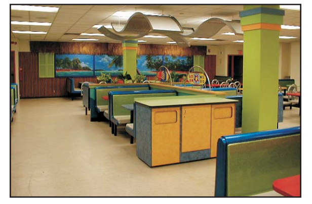
▲The 5 foot 3 inch wide condiment center at Miami Edison High School with locking storage in the middle.