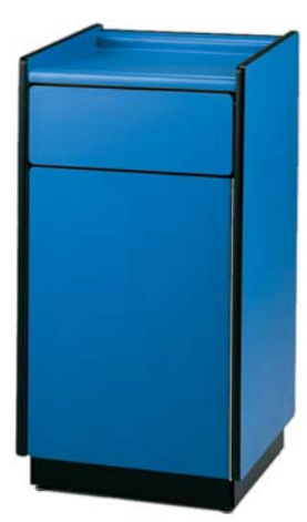
▲ Model U-2 Single trash receptacle with 20 gallon removable rigid waste container

All Trash units and Recycling units are provided with removable 20 gallon rigid waste container.