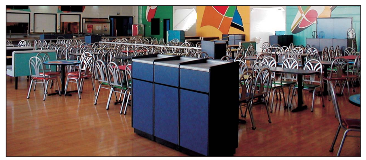
▲Compton High School trash units are accessible from any area in the dining room.