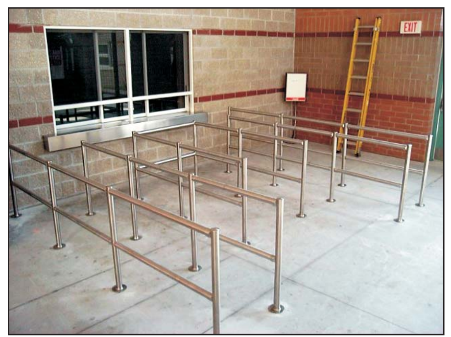
▲ Even outside serving windows need student traffic lines to prevent massing up at the window. Out lines can be reconfigured on-site if your serving needs change.