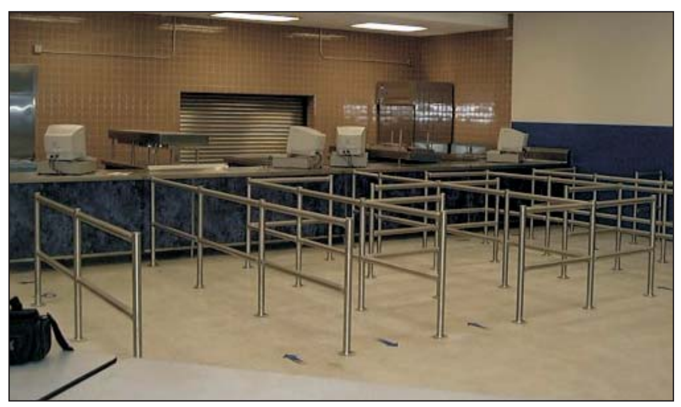
▲ Serpentine lines funnel students in an orderly and controlled manner — 1 student at a time.