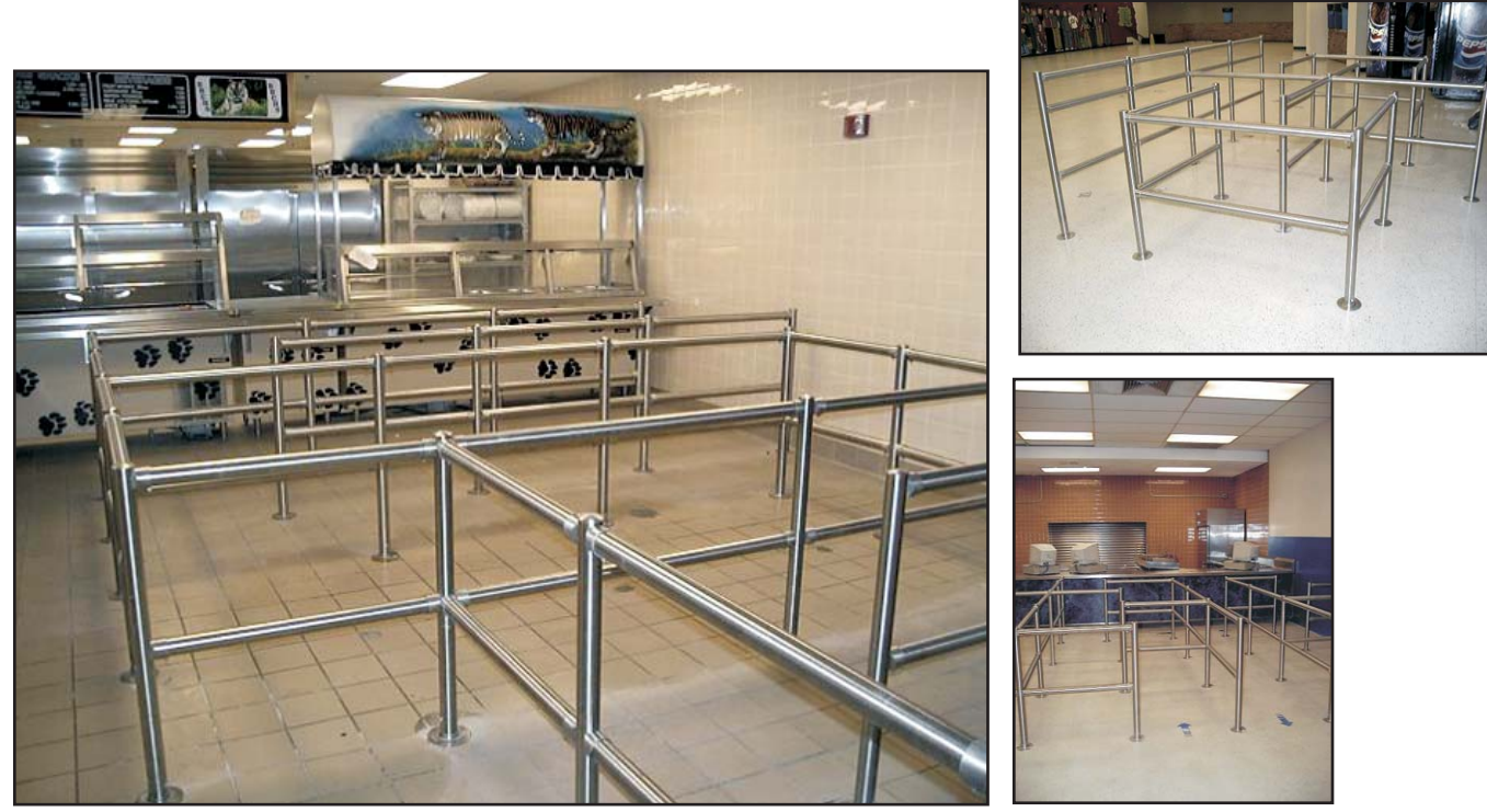
▲ These are some examples of the designs we create based on each school's space and traffic flow needs. The serpentine design slows the student down and allows your serving staff to have control over the point of sale area.