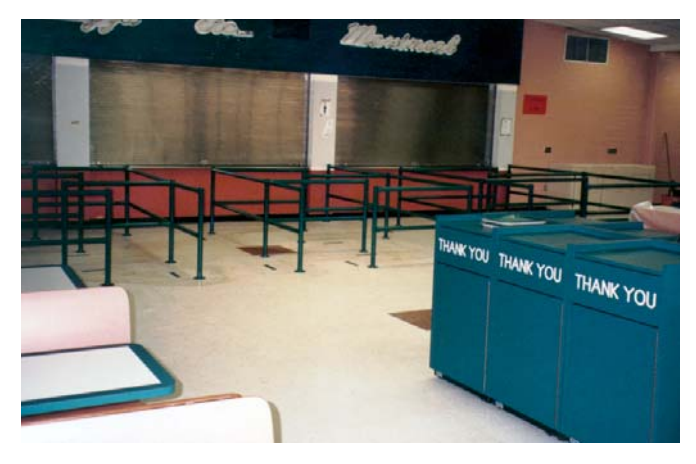
▲ Fixed-in-floor railing system colors complement your dining room décor.

Create efficient student flow through the serving lines with fixed or portable traffic control units.