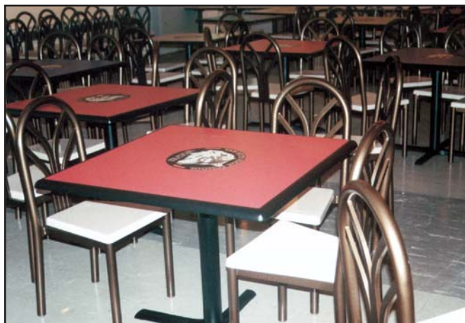
▲ Wolf logo inlay with PermaEdge™ finish at Van Nuys High School, California.