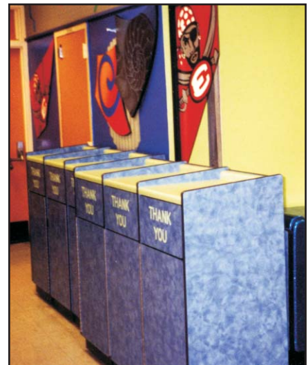
▲ Miami Edison H.S. in Miami, FL, with a contrasting color on the tray return area and optional message on the flipper doors.