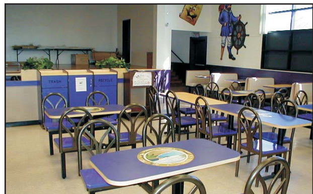
▲ Pacific High School in San Bernardino, California with pirate purple finish.