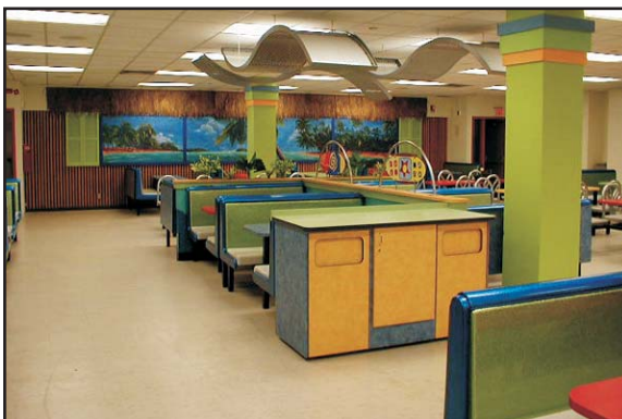
▲ The 5 foot 3 inch wide condiment center at Miami Edison High School with locking storage in the middle.