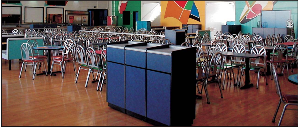
▲ Compton High School trash units are accessible from any area in the dining room.