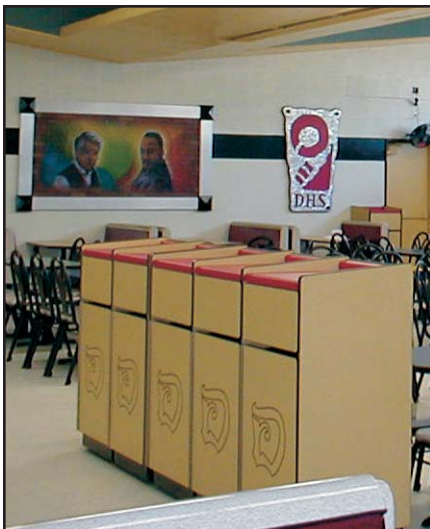
▲ Dominguez High School in Compton, CA with optional school logo on the front.