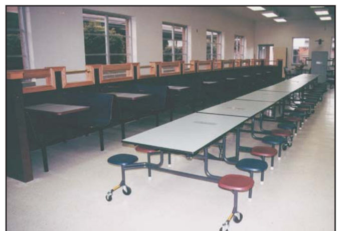
▲ Combine traditional with contemporary with stool tables and booths creating a tasteful and pleasant décor.

Over 215 exciting colors for the tables to brighten up your multipurpose rooms. See page 43-38 for chart of available colors.