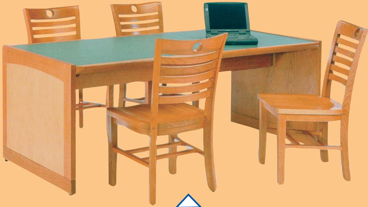
Chancellor Full Panel Style rectangular reading table with crafted face veneers.

Did you ever think ash & oak would look so good together?