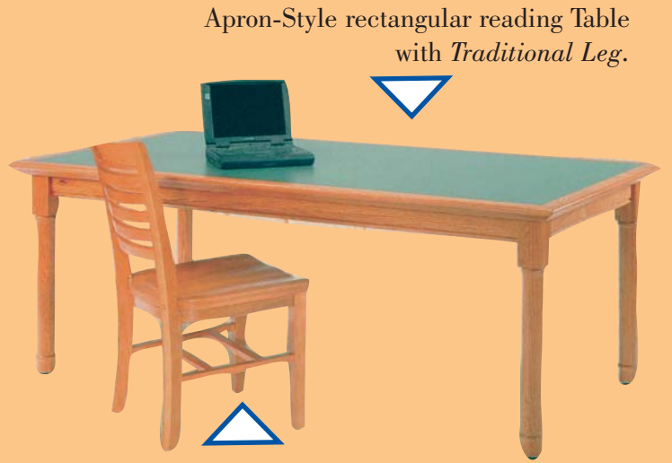
Parallax wood chair.