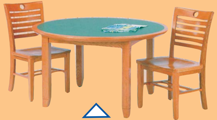
Chancellor Apron-Style round reading table with Chamfered Leg.

Did you ever think ash & oak would look so good together?