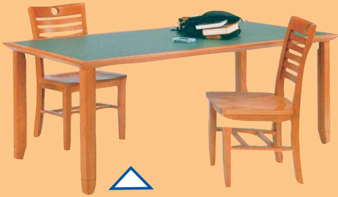
Chancellor Apronless rectangular reading table with Chamfered Leg.