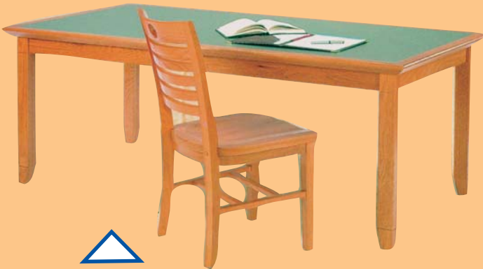
Chancellor Apron style rectangular reading table with Chamfered Leg.